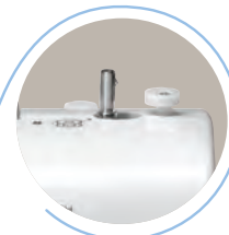
Automatic Bobbin Winding