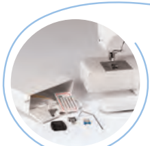
FREE Accessories Included