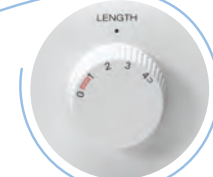
Variable Stitch Length