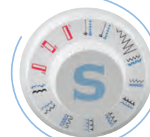
Easy Stitch Selection