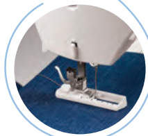
4-Step Automatic Buttonhole